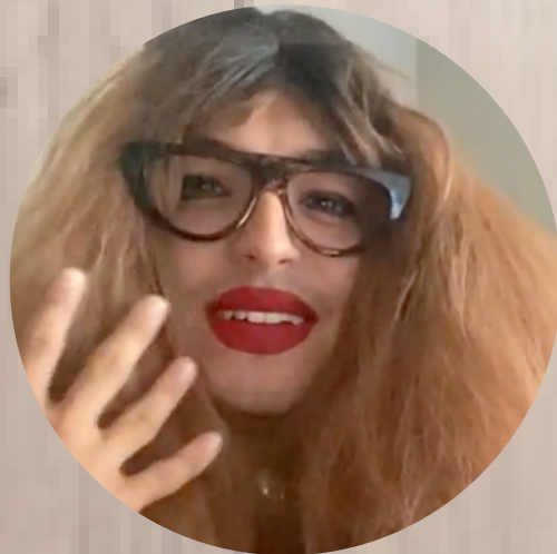
ELENA de HUEVOS

Delaware Supreme Court Nominee. Big carnivore.